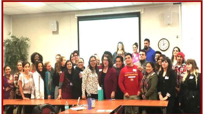
Sierra College students in attendance at ELECT HER workshop on March 10