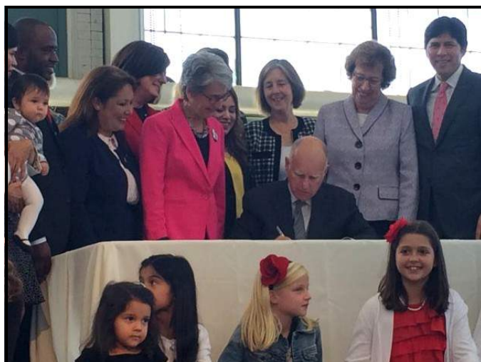
AAUW Members witness the signing of SB 358, the Fair Pay Act by Governor Brown

Held at the Rosie the Riveter National Monument in Richmond, invited guests included seven “Rosies”—all in their late 80’s and early 90’s and very articulate! They were paid wages equal to non-combat men doing the same work, even in the 1940’s! Many coalition members brought their children, who were invited to sit on the stage – after all, they can benefit from Fair Pay legislation in the future!