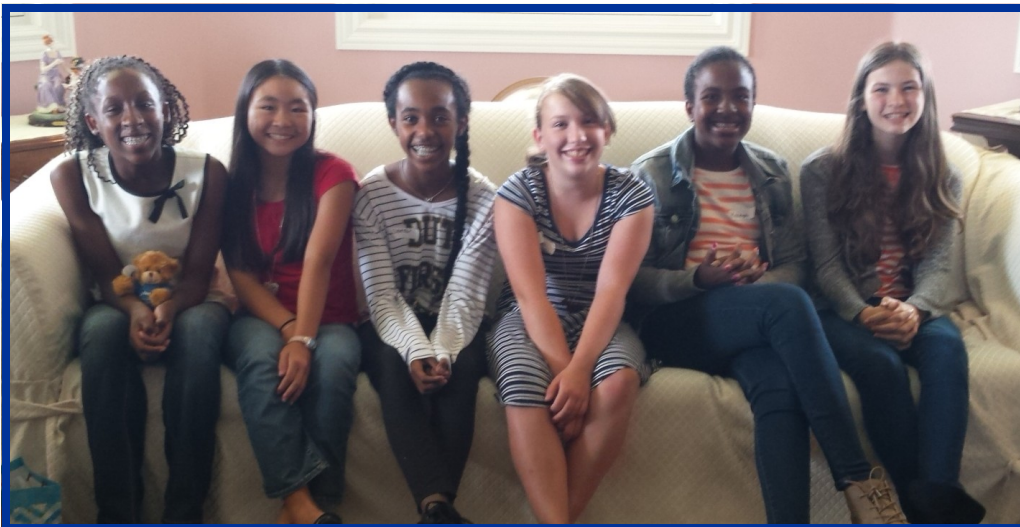
The young ladies in the picture are from left to right: